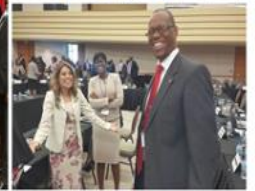
CFATF Plenary and Meeting 2018