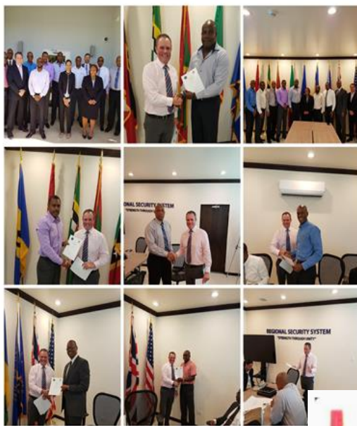
Prosecutor's Advanced Training Course 2018