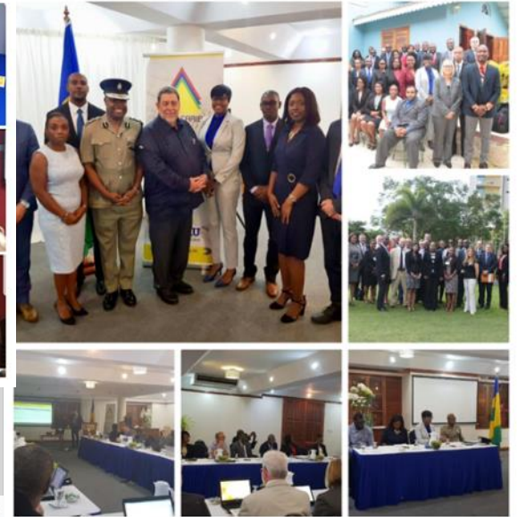
ARIN/CARIB AGM & Conferences 2017-2018