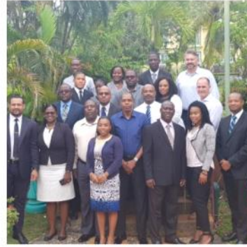
Suspicious Activity Report Training– St. Lucia