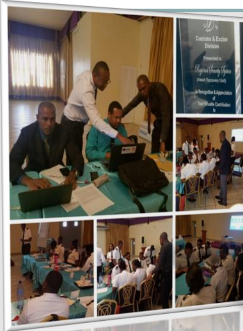
Customs and Excise Training in Grenada