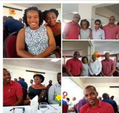
FIU Directors Management Training 2017